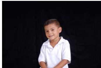
Israel - Age 5