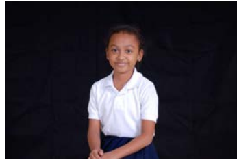
Yes - 4th Grade