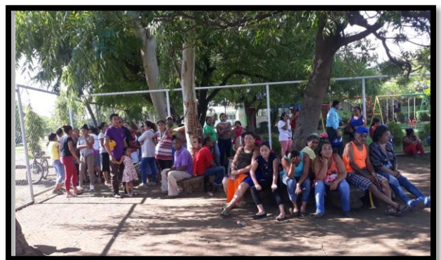
People waiting for medical treatment at NCS

Our goal every year is to be a blessing to the people of Nicaragua. We come home every year truly believing that we were the ones who received the greater blessing. This year, two members of our group have decided to support a child at the school. It is our conviction that God is doing something great through the work of Nicaragua Christian School. We are humbled to have a small part in that.