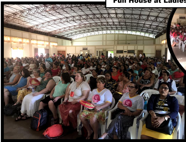
Full House at Ladies Day 2019