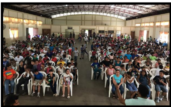
Record numbers at VBS this year

encouraging thing about VBS was the teenage class that had over 100 every day. We owe special thanks for a number of faculty and staff from Nicaragua Christian School who helped us with the classes every day. The children were attentive and very engaged in what we were trying to teach.