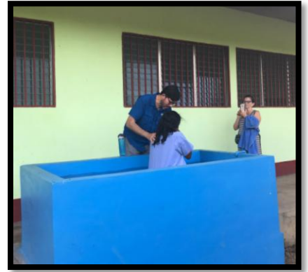
Baptism at NCS

The Nicaraguans are doing an excellent job of taking over responsibilities of running the school and evangelizing. However it is not possible for them to provide the money necessary to assure the future for the school. The church there is reaching more and more people due to the success of the school and the trust and enthusiasm it has generated in the community. Please consider helping to assure the future of Nicaragua Christian School and the church that meets in the building there by including NCS in your "will". A suggestion, if you have children, is to add the school as a child's part to your "will". By doing this you can help perpetuate the school and assure God's word will be taught for many years to many, many people.