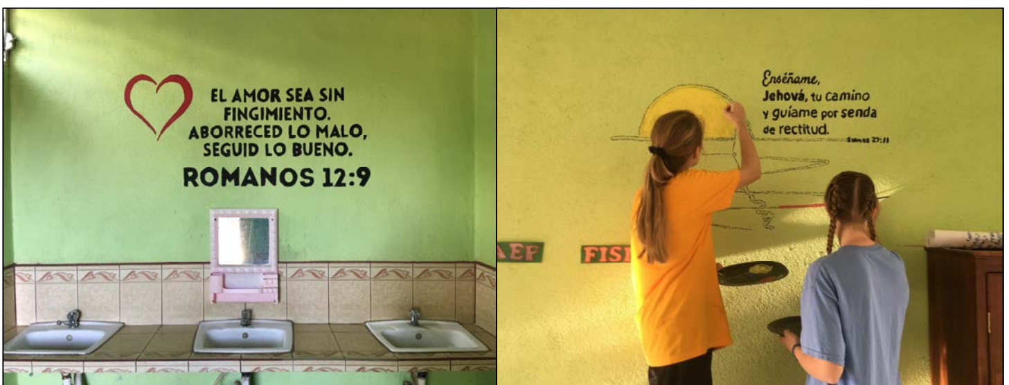
image on the right: "Teach me Lord your way and guide me in the straight path." Psalm 27:11