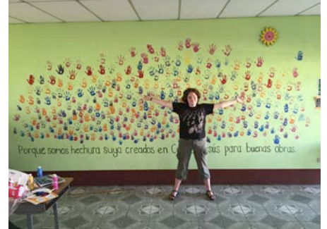
Handprints on the Library Wall